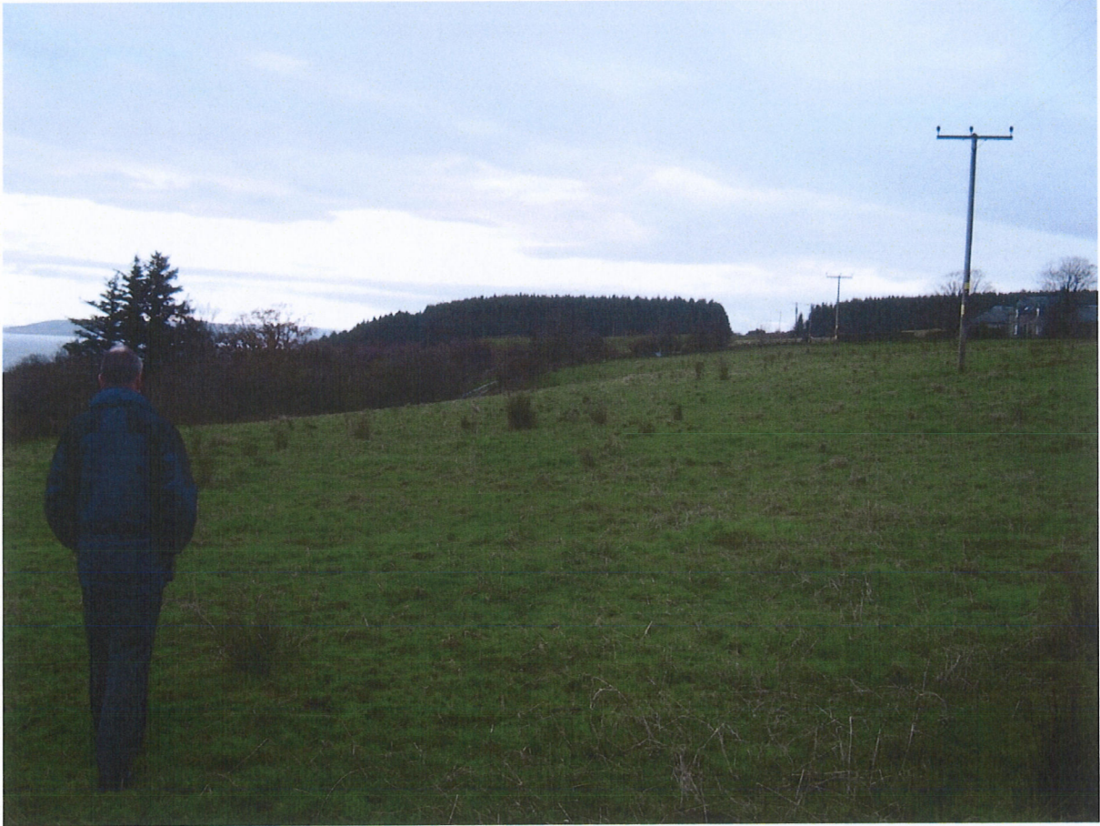
Photograph 5: This photograph is from Winter 2009 / 2010 and shows the view towards the approximate location of the northernmost plot looking north west with the Achnadriane Farmsteading in the middle distance.