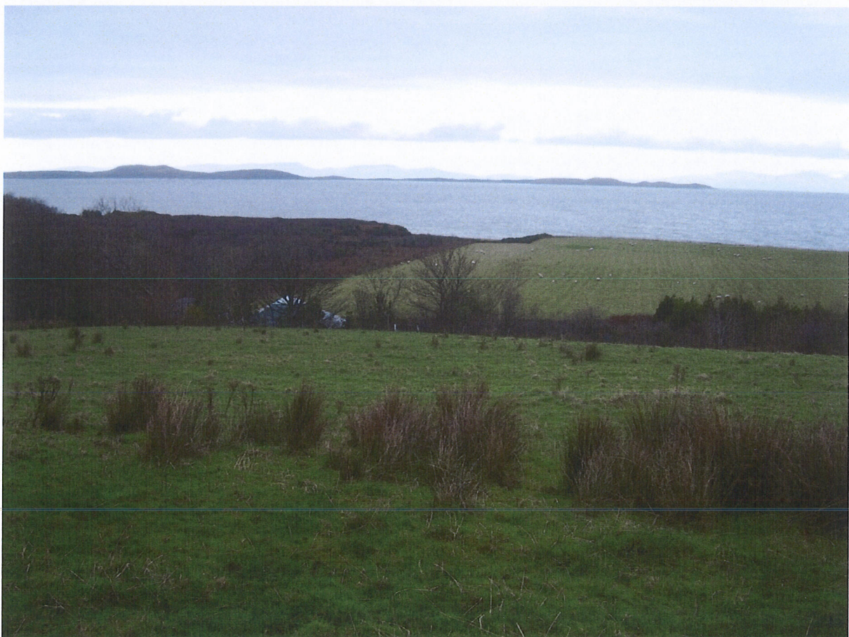
Photograph 4 : This photo is from November 2007 and shows the view from the vicinity of the southernmost plot. Looking broadly towards the northernmost plot and with Achnadriane Farm in the background to the right hand margin of the picture.