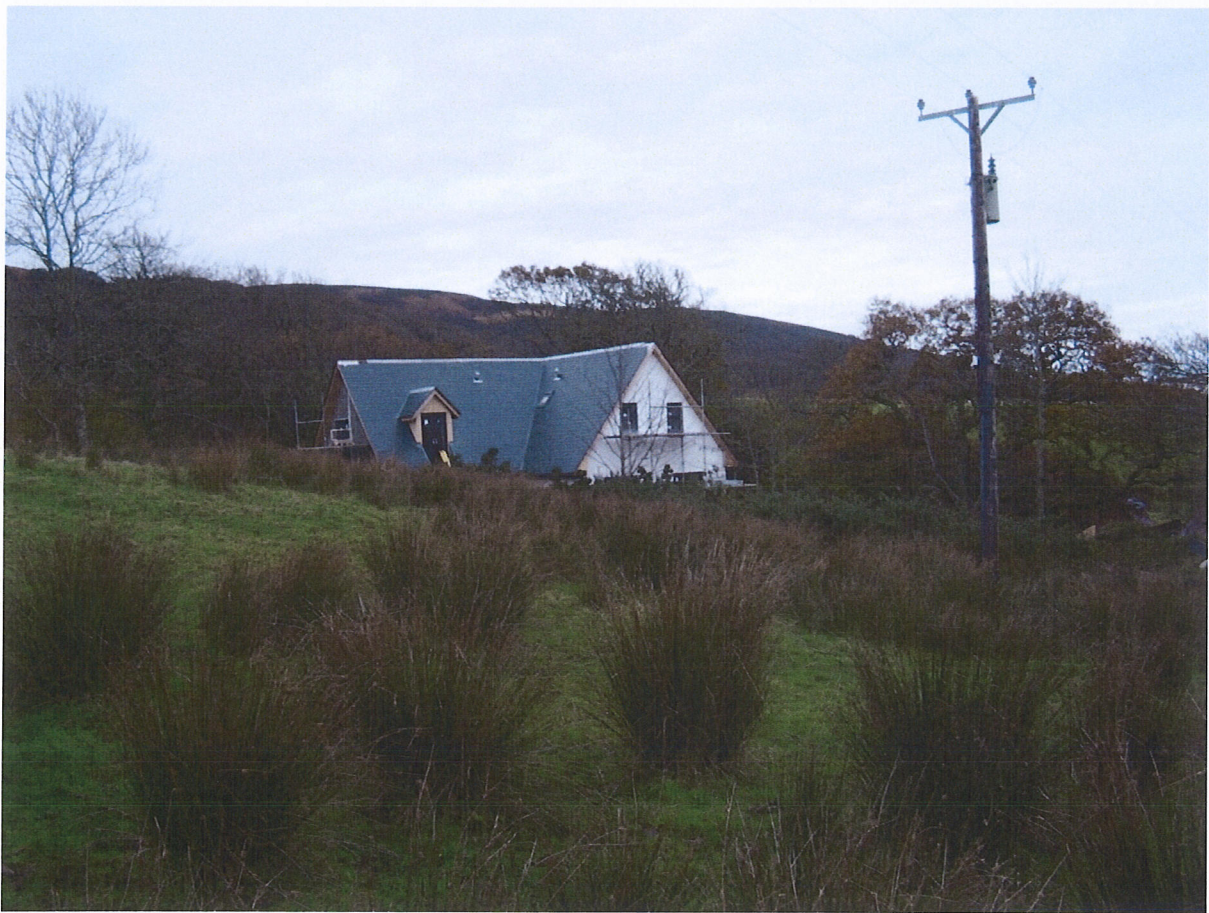
Photograph 3 : This photo is also from November 2007 and shows the view from the approximate position of the northernmost plot out to the south west with Benview visible in the distance.